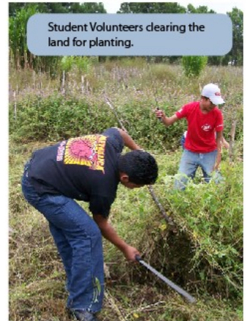
Student Volunteers clearing the land for planting.

water a day (6-8oz) because the water we have is contaminated and to buy the bags of water is very expensive. Just to let you know everyone should drink six to eight 8 oz glasses of water a day and a pregnant woman should drink almost double that.