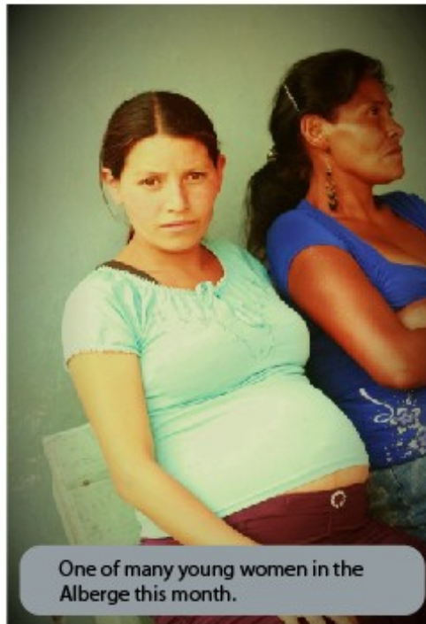
One of many young women in the Alberge this month.