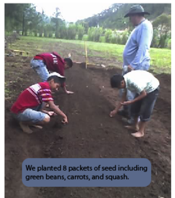
We planted 8 packets of seed including green beans, carrots, and squash.

We are so excited to be a part of Gods work and to see what has been done and what is being done! We along with the Hope and A Future Students from Mercy International have cleared a portion of the land behind the hospital and planted many vegetables since the placement of the well. We will continue to clear more land and plant more vegetables. We will keep you posted on the progress!